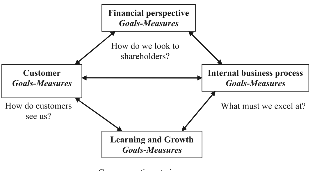
Figure 1: The Balanced Scorecard (Kaplan and Norton, 1992)